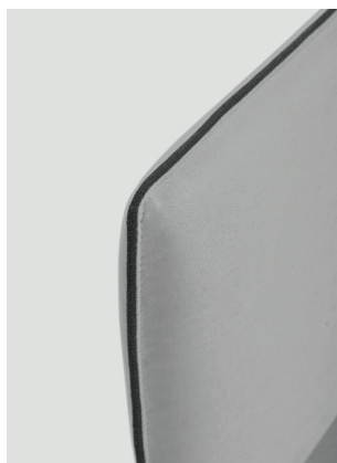
bordino morbido in contrasto