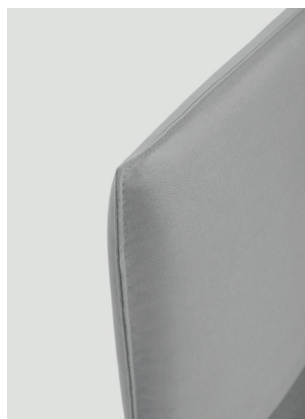
nervetto ribattitura inglese