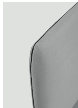
nervetto con inserto