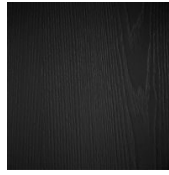
C05 CARBONE ASH