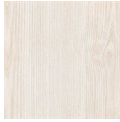
C01 NATURAL ASH