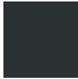
ANTRACITE RAL 7016