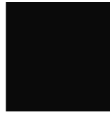
NERO CL. I RAL 9005