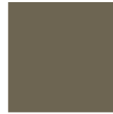
TORTORA RAL 7006